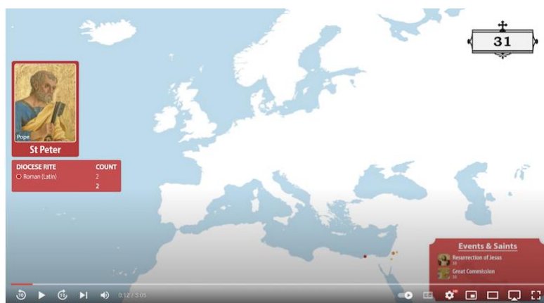
Timelapse of Every Catholic Diocese in History

The Screen shot above is of a short Timeline (5 minutes) of every Catholic Diocese (not church) that existed in History. It also will have the picture (on the left, St Peter) of the Pope at the time and Top right box is the year that is being shown. The important events on saints on the bottom right will show precisely what is says.